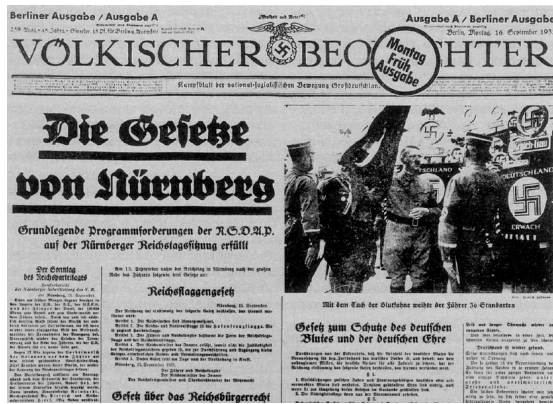
Nürnberger Gesetze, NSDAP-Zeitung, 1935